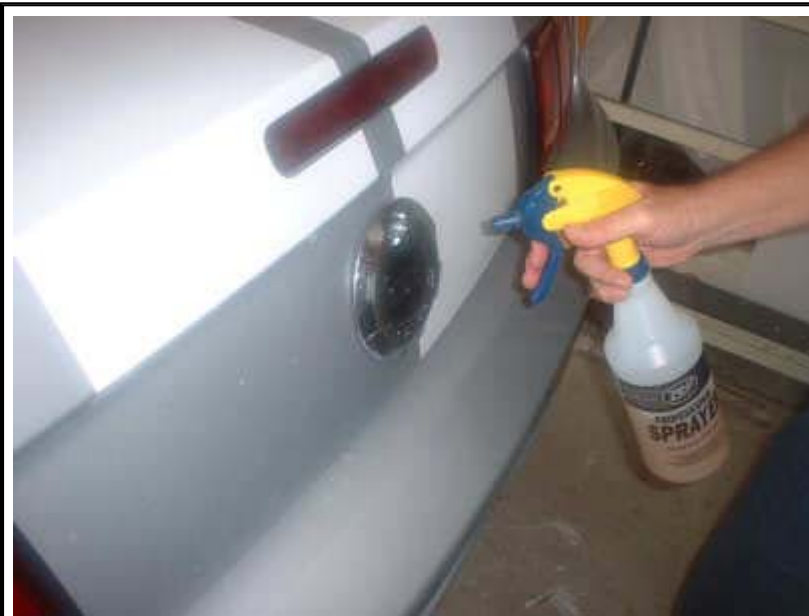
Now lets tackle the bottom portion of the trunk. Wet the area liberally with your liquid solution.