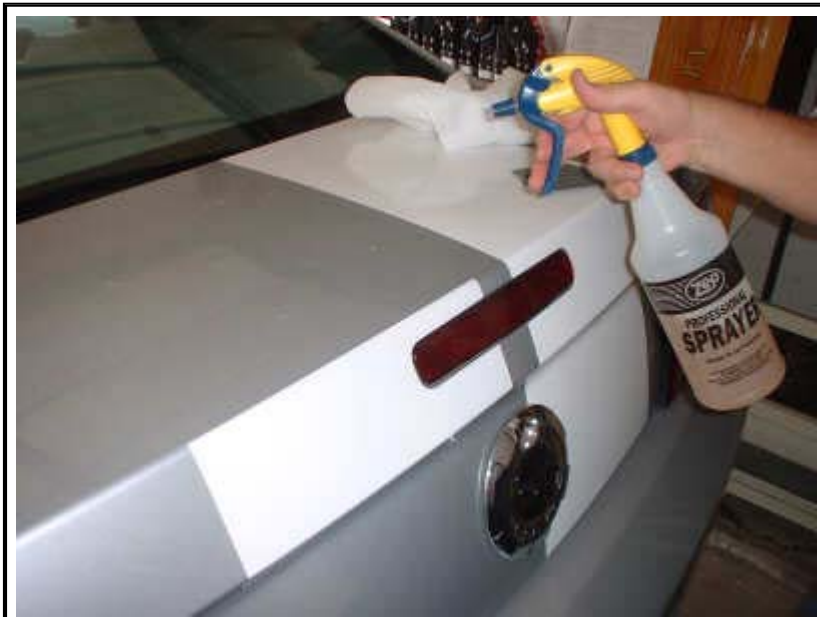
The basics of the process are identical for every decal applied. Let's install the top of the trunk. Wet the area with your liquid solution.