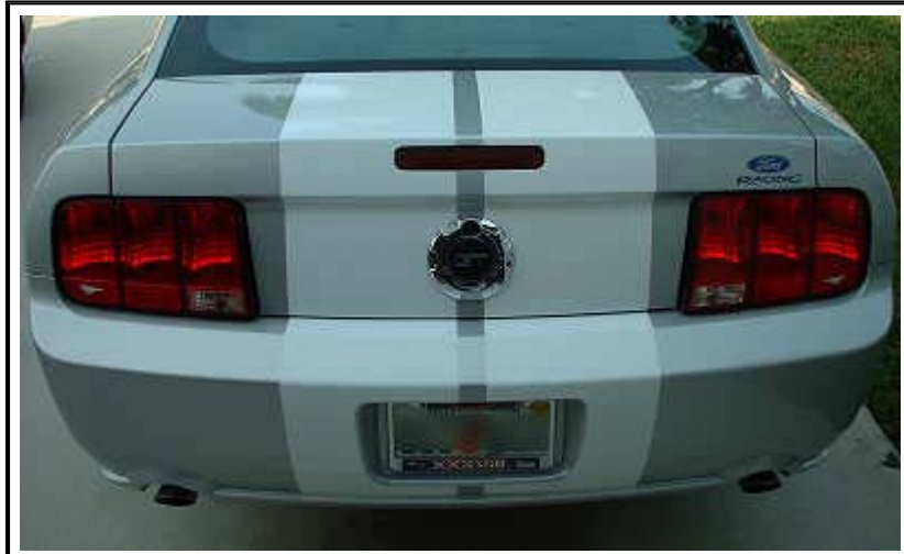
Here's a look at the finished product.