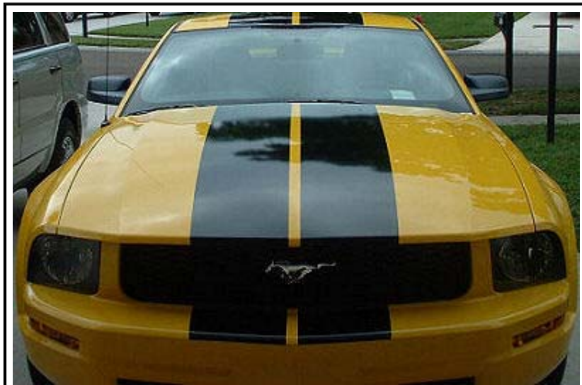
Accomplish the rest of your vehicle using the steps shown above. Enjoy your new decals!

HOME CATALOG CONTACT US 3M COLORS CUSTOM DECALS SHOWCASE HELP FAQ VIEW CART