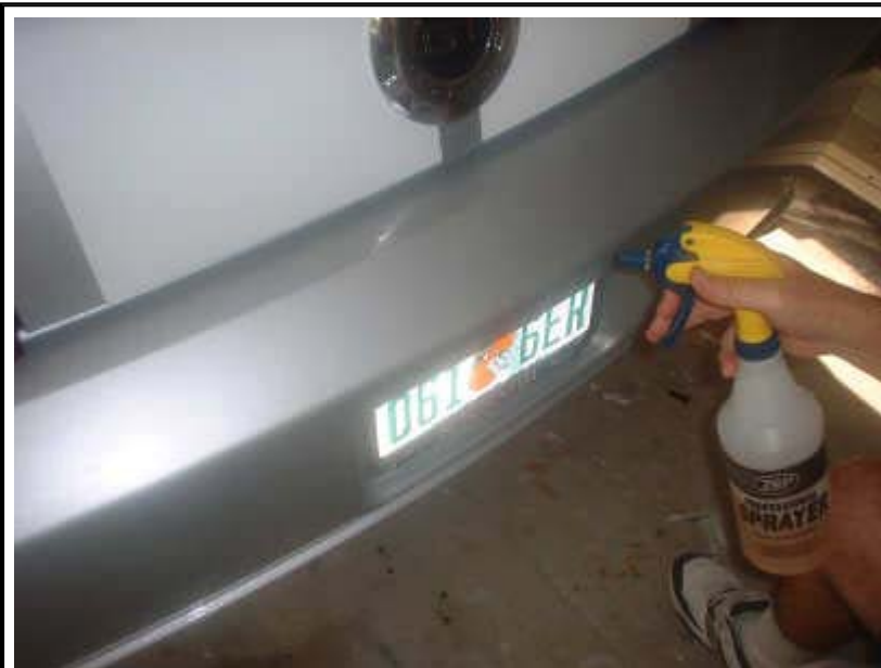
Next Step! Let's do the rear bumper. Liberally spray the area with your solution. Remove the backing paper from the decal.