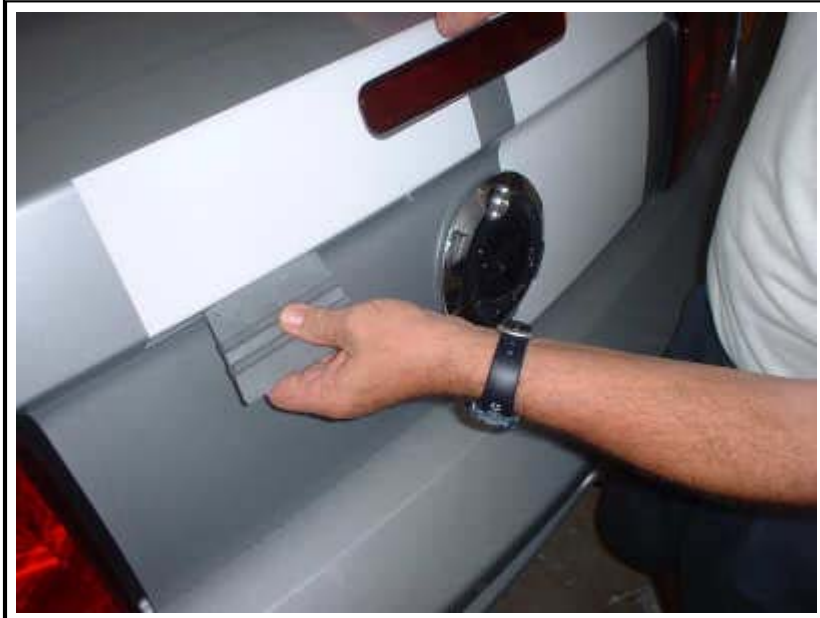
Smooth the bottom portion of the decal around the lip of the trunk.