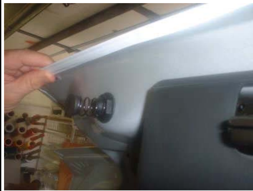
Wrap the remainder of the decal to the underside of the trunk.