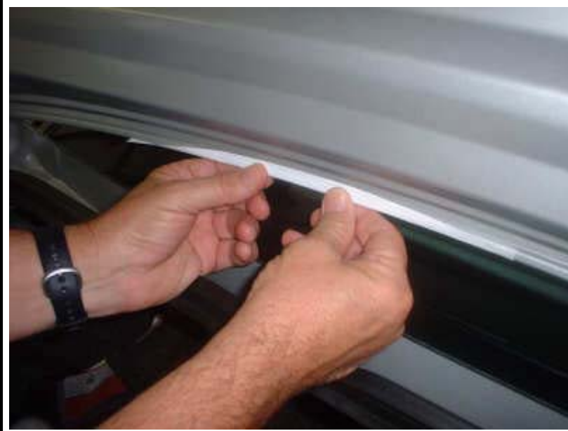
Wrap the remainder of the decal to the underside of the trunk.